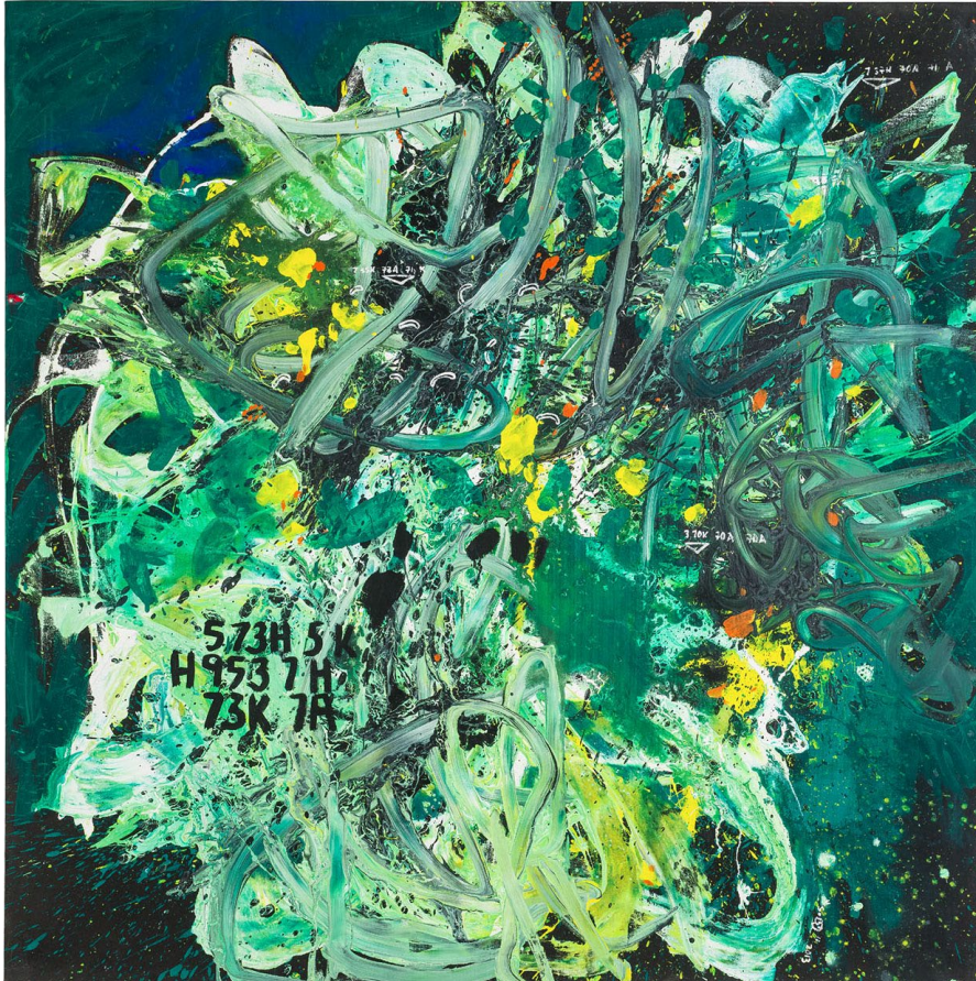
Soli Cissé - «G comme V» - 2013