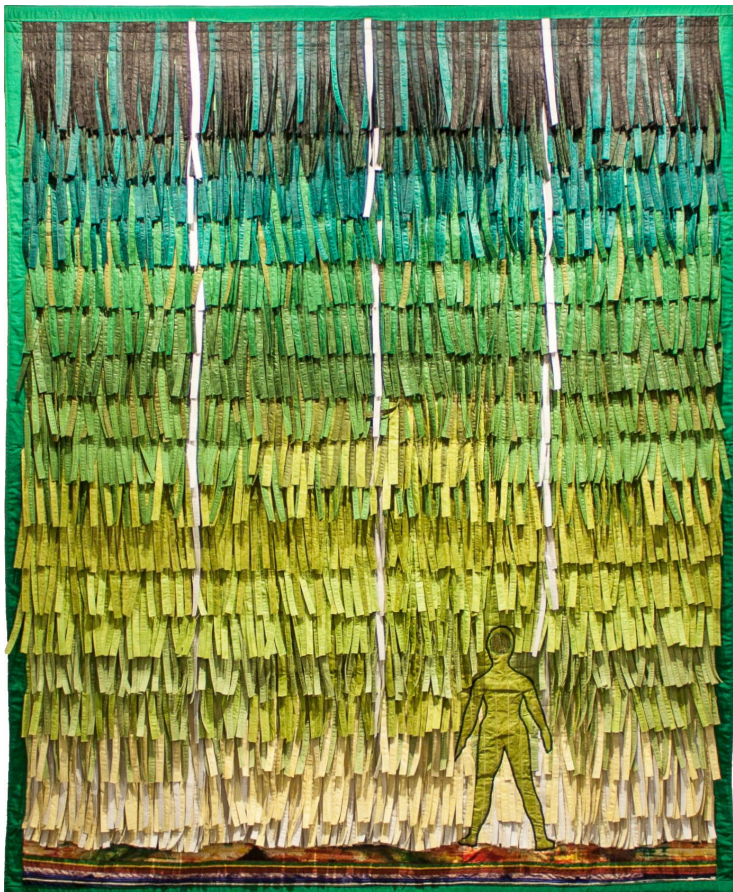
Abdoulaye Konaté - «Homme Nature» - 2013