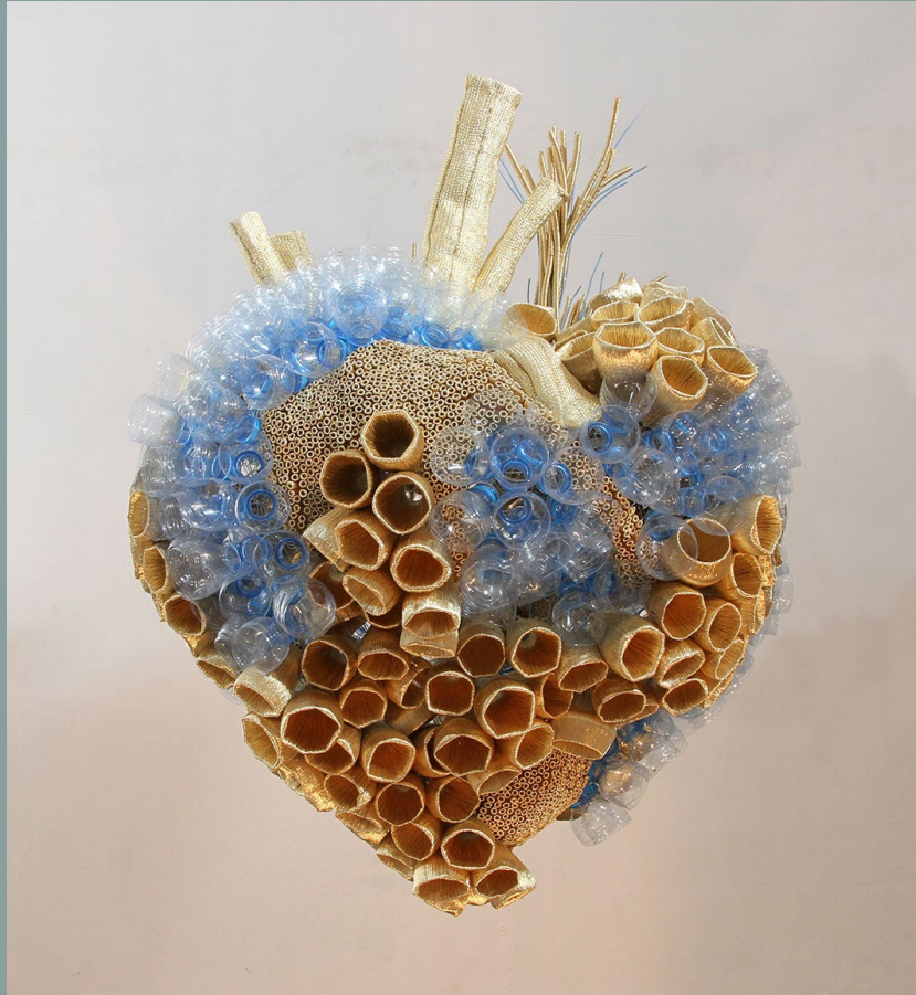
Ghizlane Sahli - «Le Passager» - 2018